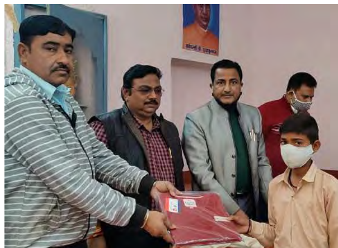
Rajakiya Uchh Madhyamik Vidyalaya, Banswara

The winters hit a record-breaking low making it difficult for the deprived ones to survive. In addition, Covid has left most BPL homes devoid of the disposable income to invest in warm clothing. Hence, the foundation decided to distribute 3,000 sweaters in different parts of Rajasthan.