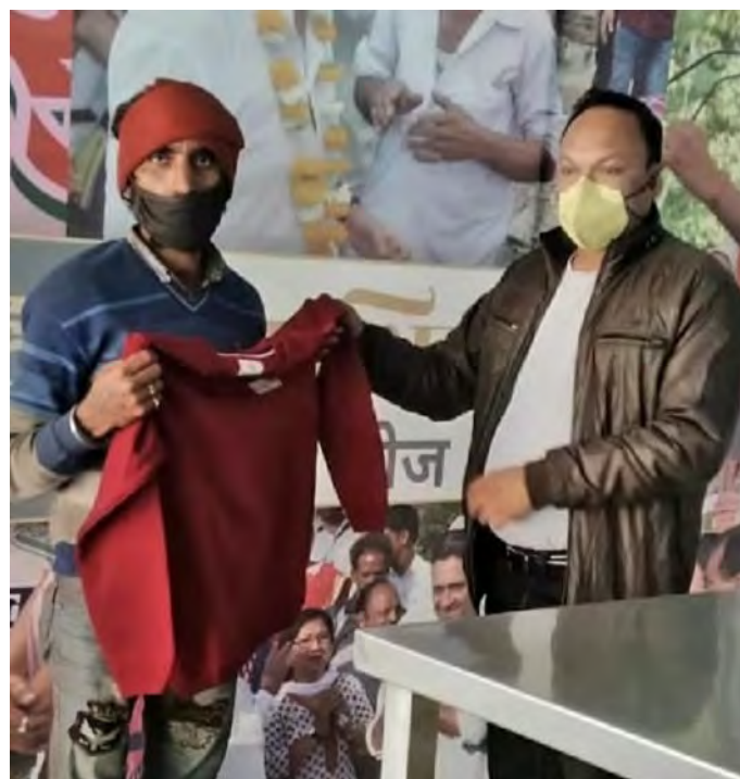
Swabhiman Bhoj, Bhilwara

The distribution happened in phases. The first phase of distribution happened at the three Swabhiman Bhoj centres where sweaters were distributed amongst the kids, the elderly, the poor, and the differently-abled. In phase two, the foundation visited government schools in and around Banswara and distributed the sweaters amongst students. Students at these schools are usually from economically-challenged backgrounds. In phase three, the distribution took place amidst the MTS workers of RSWM Ltd. ■