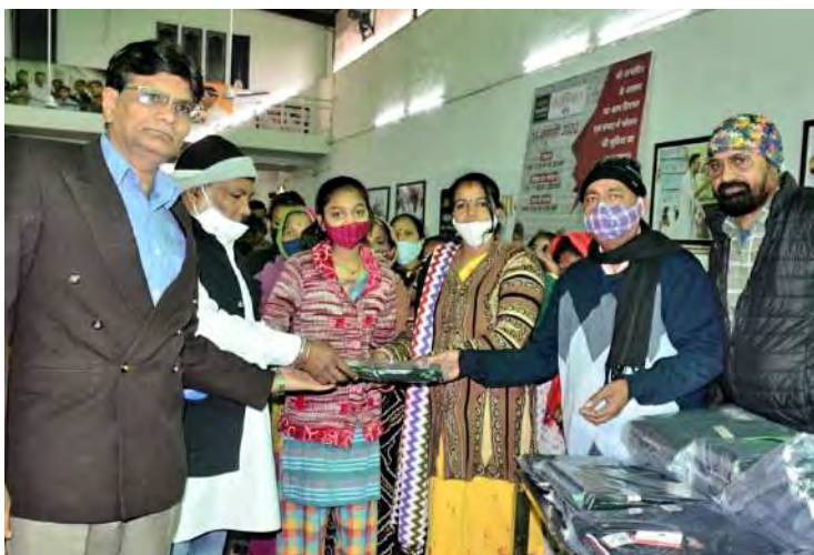
Swabhiman Bhoj, Ajmer